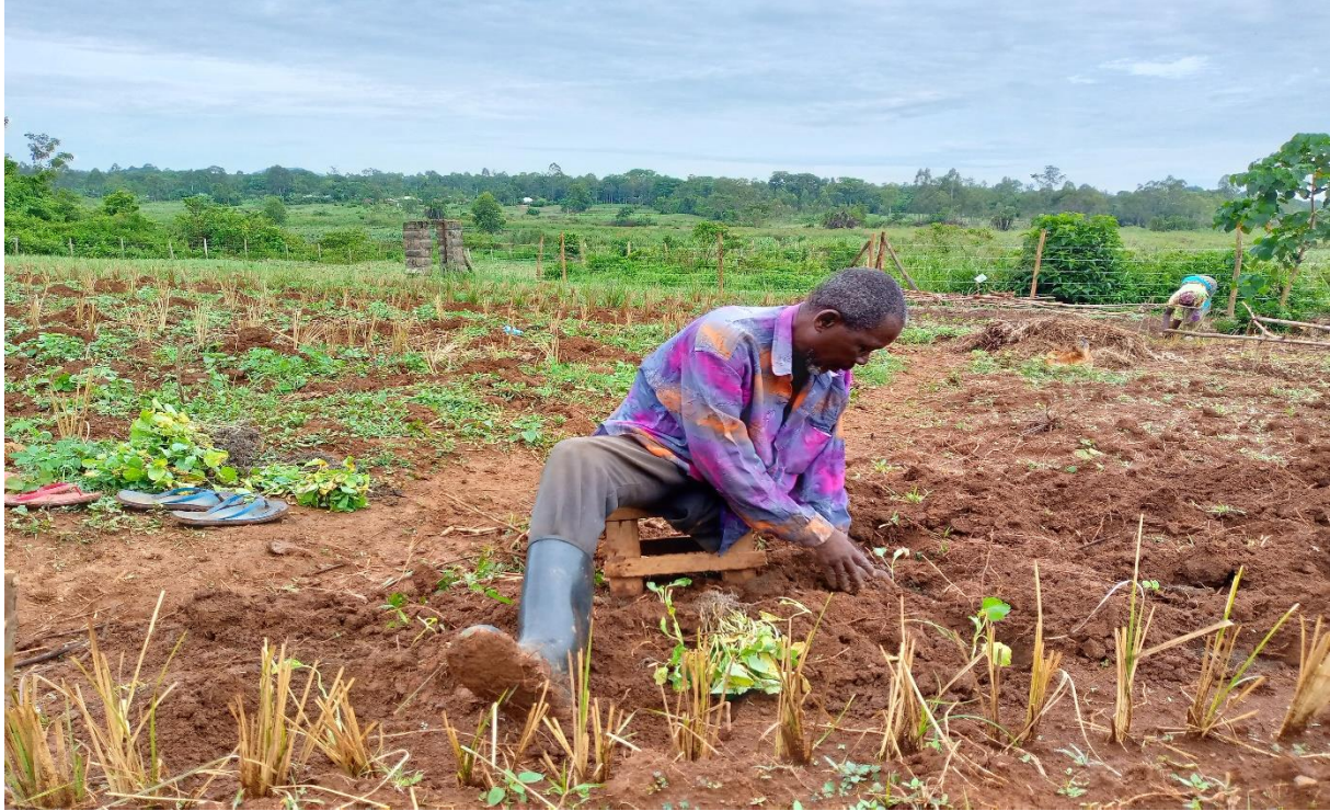
Applying Vetiver techniques: planting crops between vetiver hedge rows to prevent rainfall runoff, conserve water and treat contaminated water and soil from heavy metals.