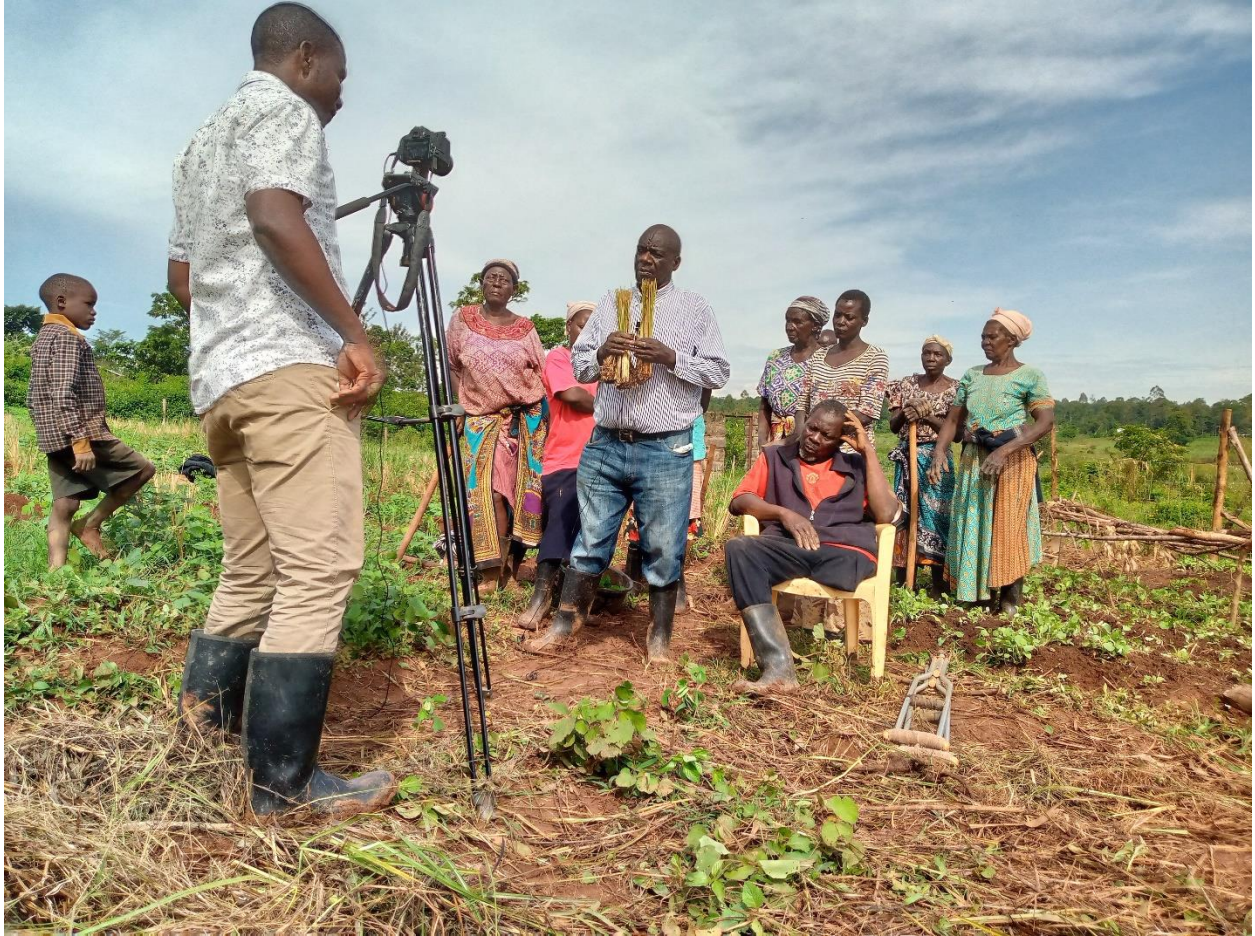
Documenting the Journey: Ganga Modern Farmers recording their journey to sustainable farming using vetiver techniques.