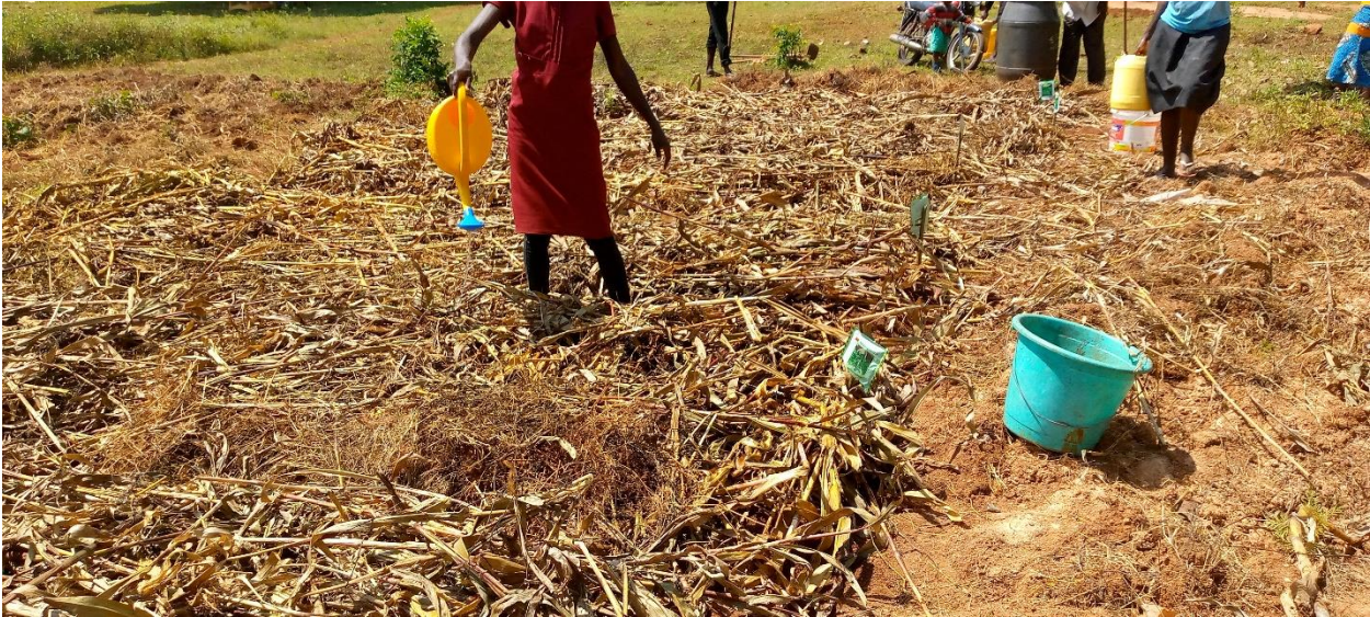
Local knowledge at work: covering top soil with dry matter and sprinkling to preserve moisture. The dry matter will be reintegrated as manure once decayed.