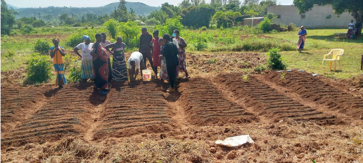
1.2 Food forest design; demo centre taking shape as Ganga modern Farmers learn about utilizing small spaces for intercropping crops and fruit trees.