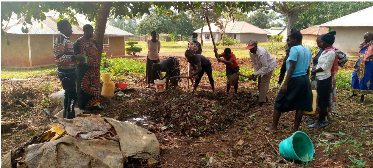
1.1 Hands on Experience; Ganga Modern Farmers, in Busia county are taken through the process of making bio-complete compost manure using available household waste; an affordable, environmentally friendly substitute to industrial fertilizer.