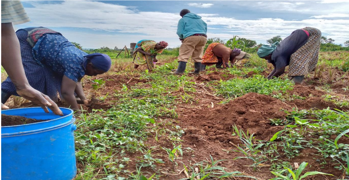
The making of a food forest: intercropping fruit trees in between other crops to demonstrate how small pieces of land can be utilized to produce different foods.